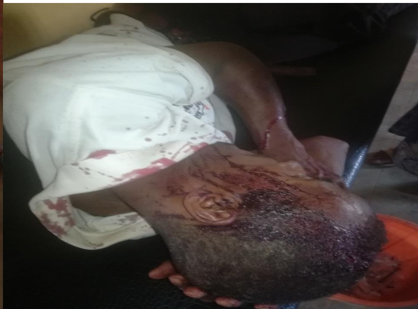
Injured on 25/7/2013 at his residence