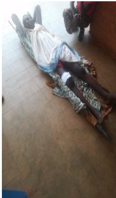
Injured on 14/7/2013